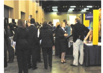
2008 College to Career Fair